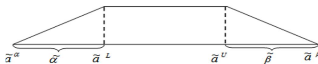
Fig 2. Trapezoidal fuzzy number